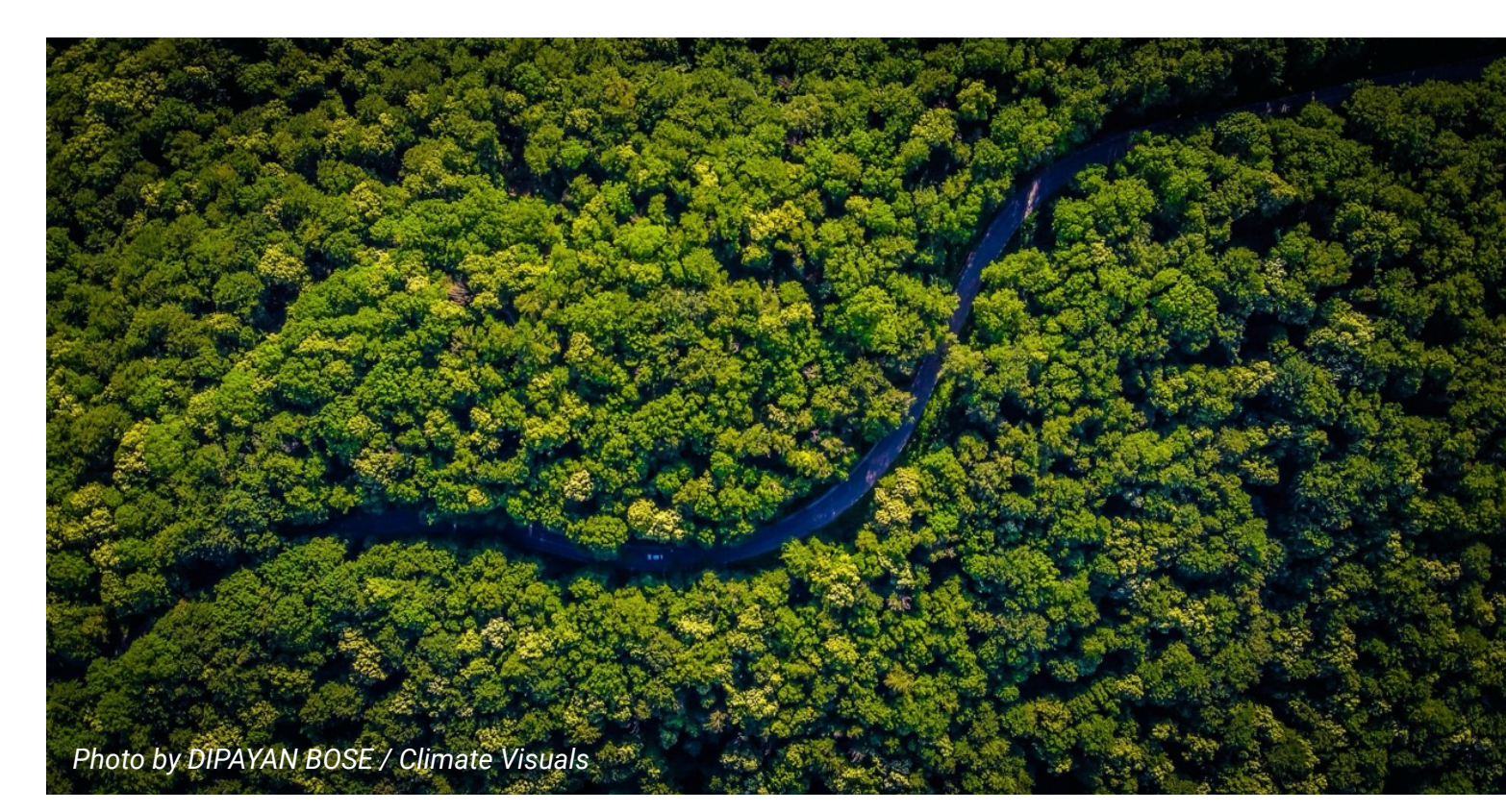
20 Bain & Company Research 2024.

The African Forest Landscape Restoration Initiative (AFR100) is supporting champions across Africa in their efforts to accelerate restoration efforts and enhance food security, with 129 million hectares committed for restoration. Restor, an open-access data network, connects over 200,000 sites where positive actions are being taken towards restoration and nature. The Trillion Trees project, supported by BirdLife International, the Wildlife Conservation Society and WWF, aims to plant 1 trillion trees worldwide to protect and restore forests for the benefit of people, nature and climate.